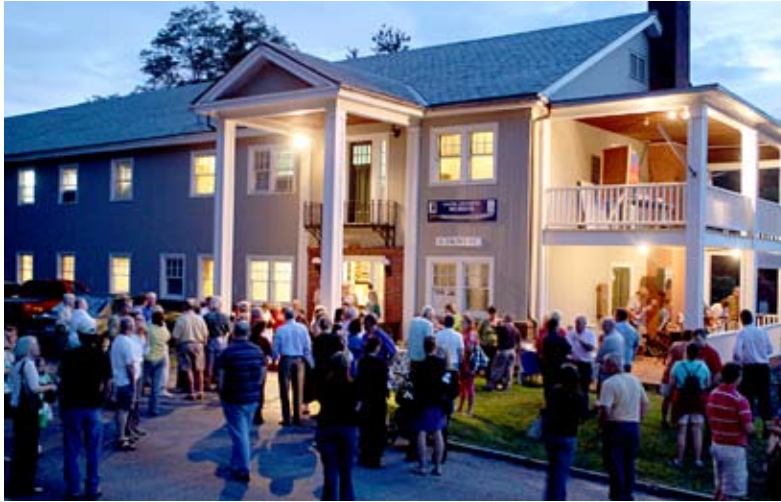
Strollers awaiting door prize drawing on a beautiful August evening.

Stroll participants needed to have their map stamped by at least six of the businesses they visited that evening to be entered in the free door prize drawings at the Museum later that evening.